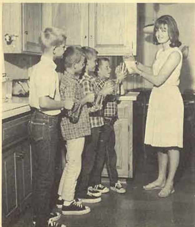
MILK SHAKE BREAK A REWARD FOR GOOD BEHAVIOR.