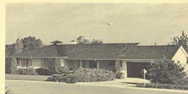
RANCH STYLE HOME IN A SAN FRANCISCO SUBURB.

Aunt Ann's usually can obtain jobs for your friends or relations with employers close enough for you to visit on your days off.