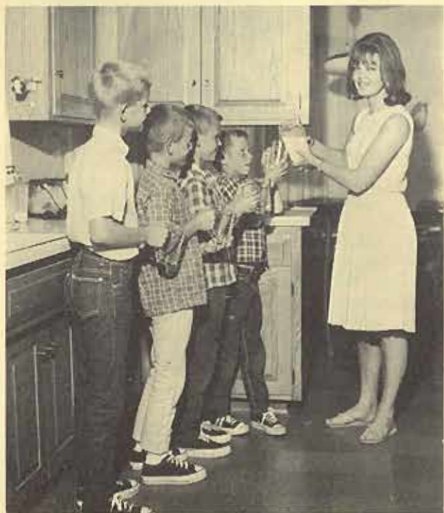
MILK SHAKE BREAK A REWARD FOR GOOD BEHAVIOR.