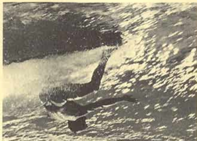
SURFING IN SANTA CRUZ IS FUN! San Franciscans can surf, water or snow ski, swim, sail, fish or hunt within a 5-minute to 2-hour drive from home. (to watch at least)